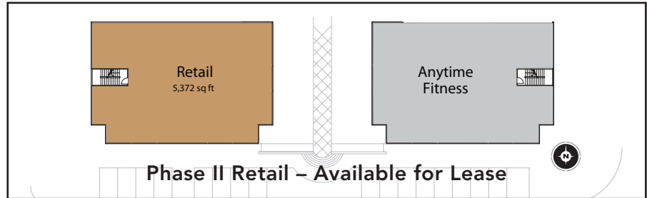
Phase II Retail – Available for Lease